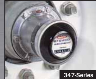
347-Series Aluminum Hub cap with Hubo Window

The STEMCO Hubodometer ® is warranted for 500,000 miles when installed in accordance with its specifications. See your STEMCO distributor for details.