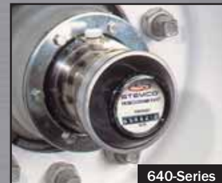
640-Series Grilamid Hubodometer ® Hub Cap