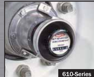
610-Series Bracket Installation

STEMCO - USA P.O. Box 1989 · Longview, TX 75606-1989 (903) 758-9981 · 1-800-527-8492 · FAX: 1-800-874-4297 www.stemco.com